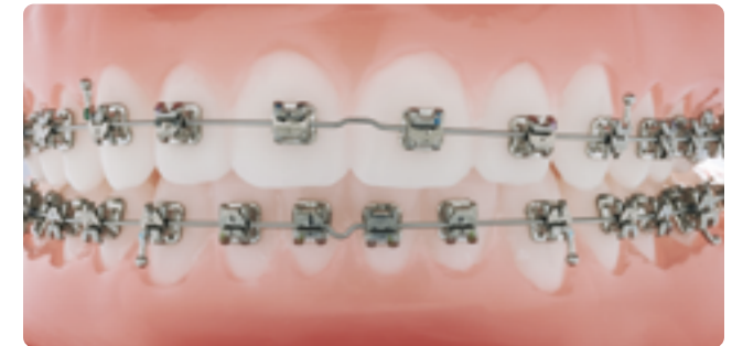
EXPERIENCE mini metal

The attachments are rhodium-whitened ( a biocompatible material) which makes your appliance less visible & obtrusive so you can carry on with your life with a confident smile. Ask your Orthodontist for further details.