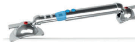
mesio – distal stop made with a flow