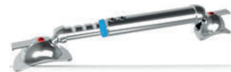
or a crimpable stop

MULTI-FA for tubes, adaptable on patients