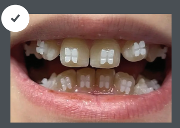
Post Cure, Adhesive Tooth Colored