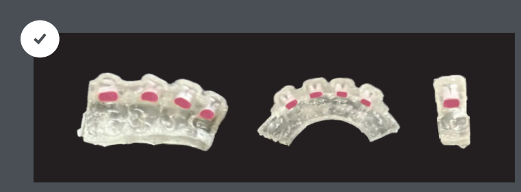
Highly Visible Adhesive Loaded & Ready for Delivery